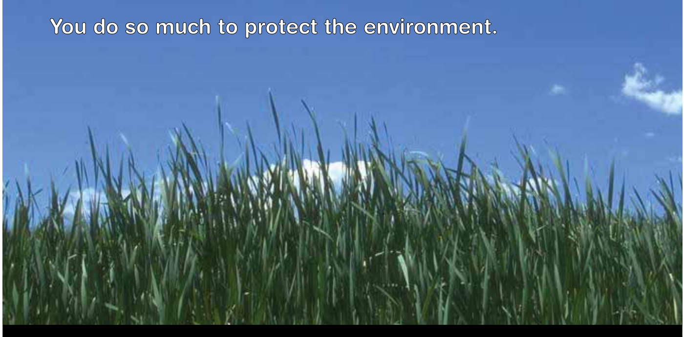
Are you doing enough to protect your association?